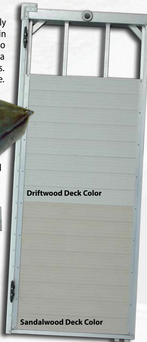
Driftwood Deck Color