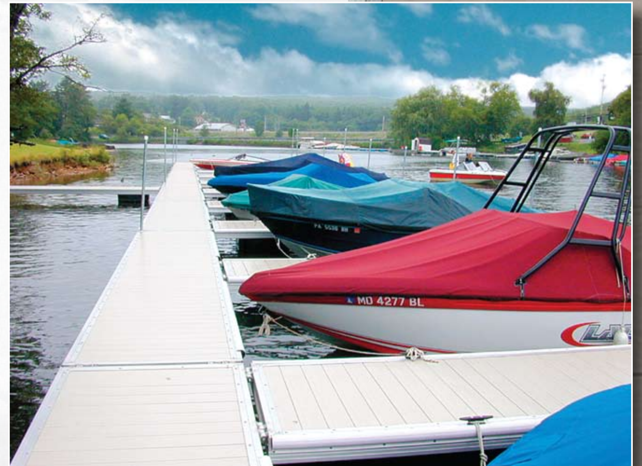
Sandalwood Deck Color

Let us prove it to you by trusting us with your custom dock order. You'll be happy you did!